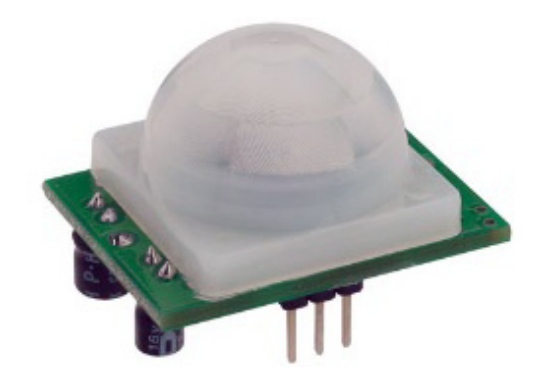
Fig. 2. Presence sensor PIR

PIR sensors (Fig. 2) allow greater battery saving since only consumed when detected emitted radiation by the human body, which activates the sensor circuit, consuming power only in that moment.