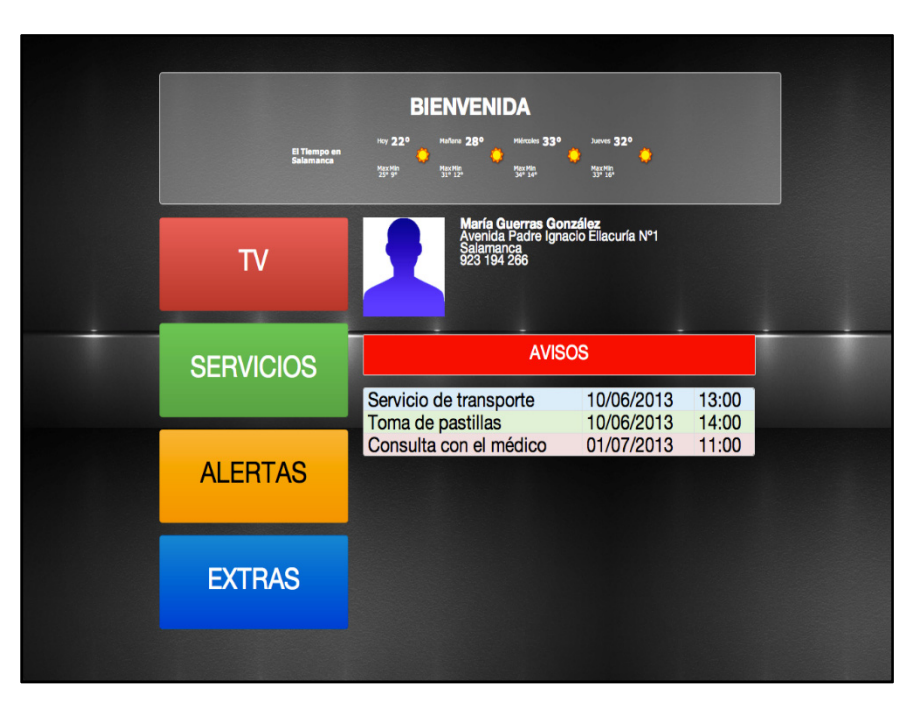
Fig. 4. Main screen

If the TV does not have HDMI connection, the system carries an infrared receiver that will map the remote control codes, so it can also be used without the need to incorporate additional control.