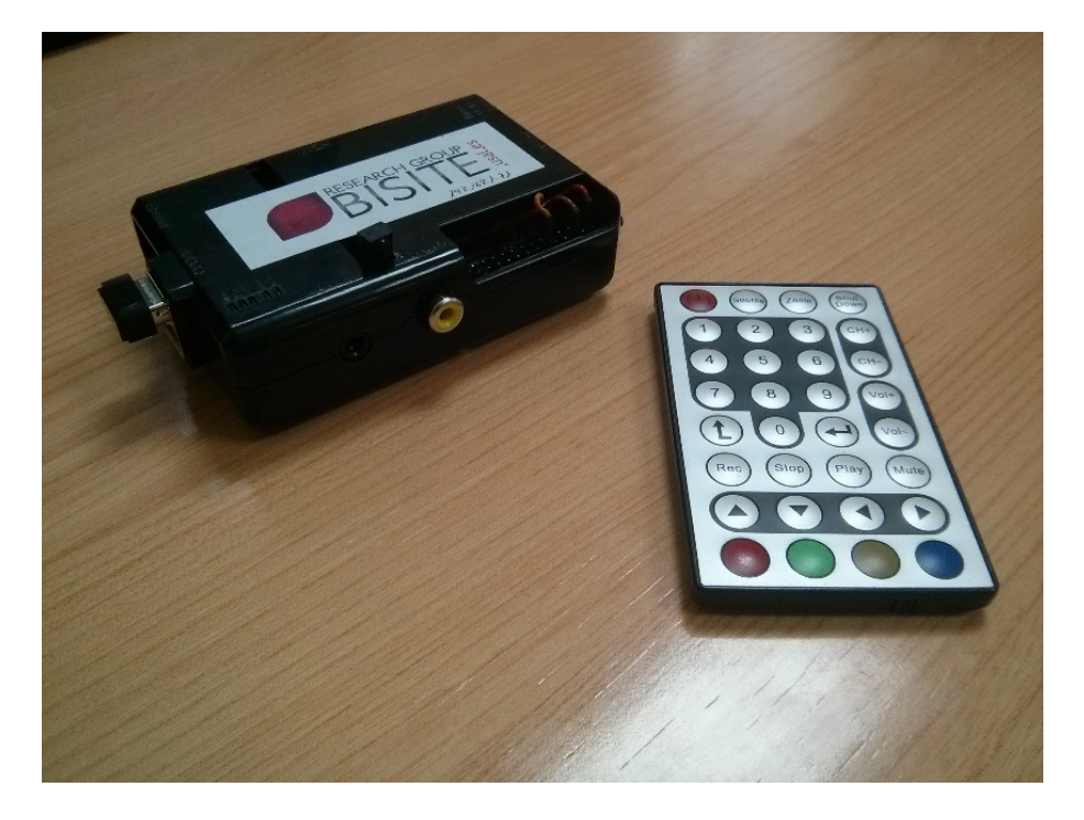
Fig. 3. Raspberry PI model B

The local exchange is a low cost computer and very low power consumption, so it just means a significant investment and saving the high costs of ongoing care of an elderly person. This unit only requires a power internet access and an HDMI connection to the TV (Fig. 3).