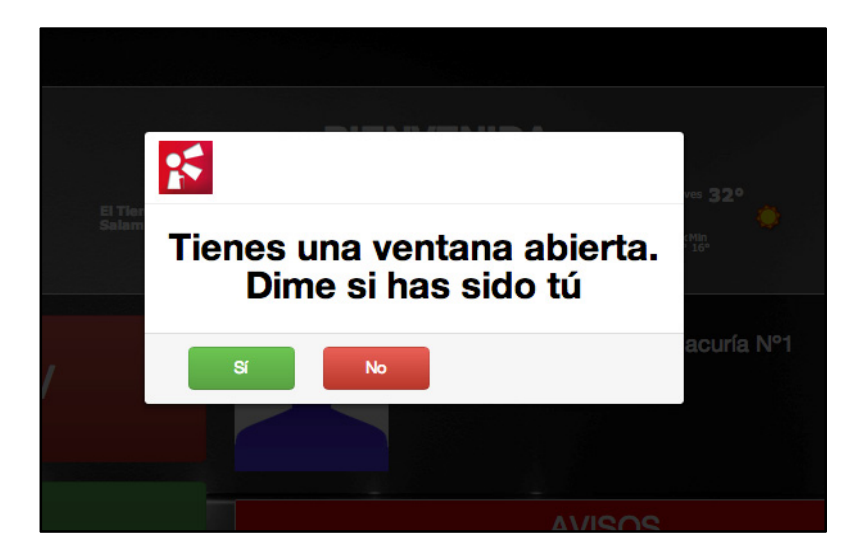
Fig. 5. Alert

The obtained results with the system have shown that integration with older people has been completely successful. The use of colors when associating with the actions of the menus has allowed a very steep learning curve, and the combination of red button with the option to back the more easily accepted. On the other hand, access of older people to the possibility of requesting services instantly without the need of relying on a phone has enabled them to increase their sense of individualism and independence. The system of reminders for taking medication or transportation schedules doctor's appointment and avoid the need to constantly check the schedules, managing largely dispel the feeling of anxiety.